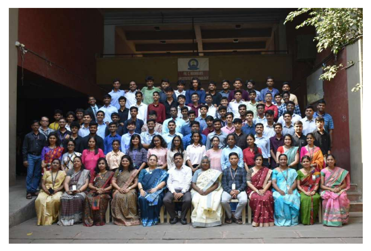
FE- Mechanical A and B