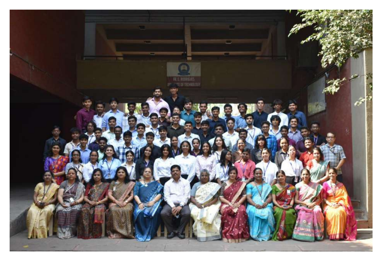
FE- Information Technology