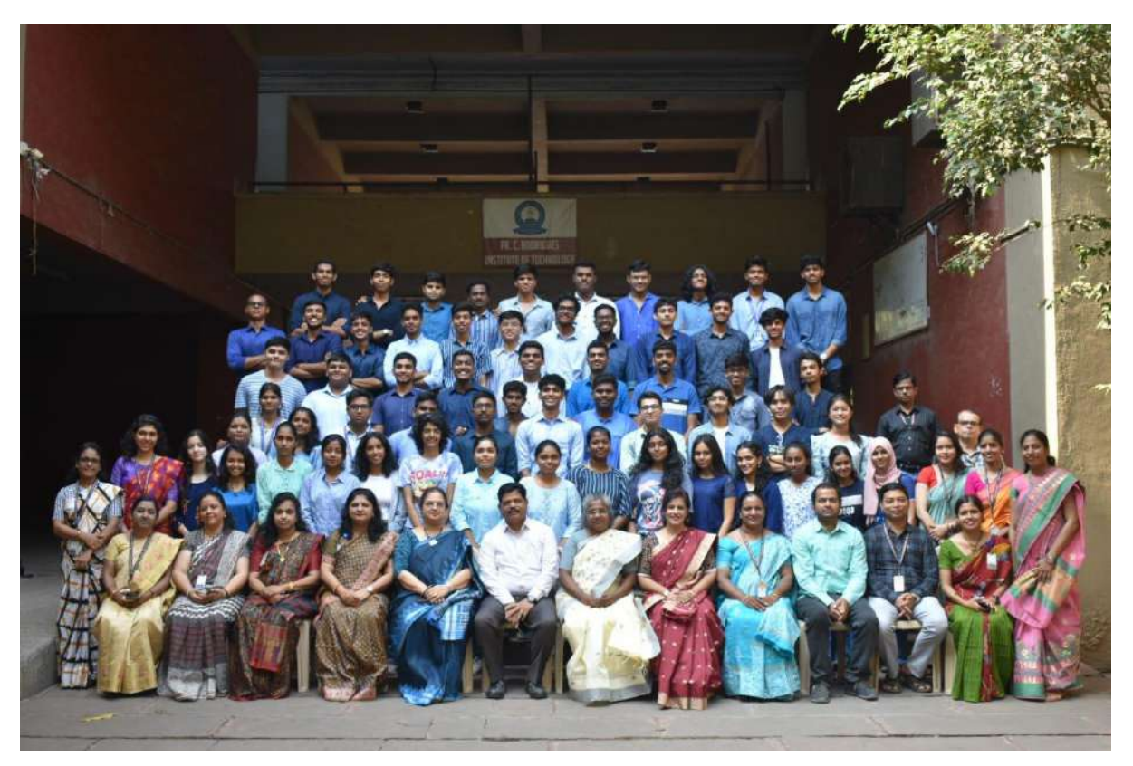
FE- Computer –A