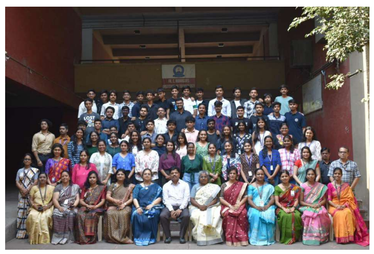
FE- Computer –B