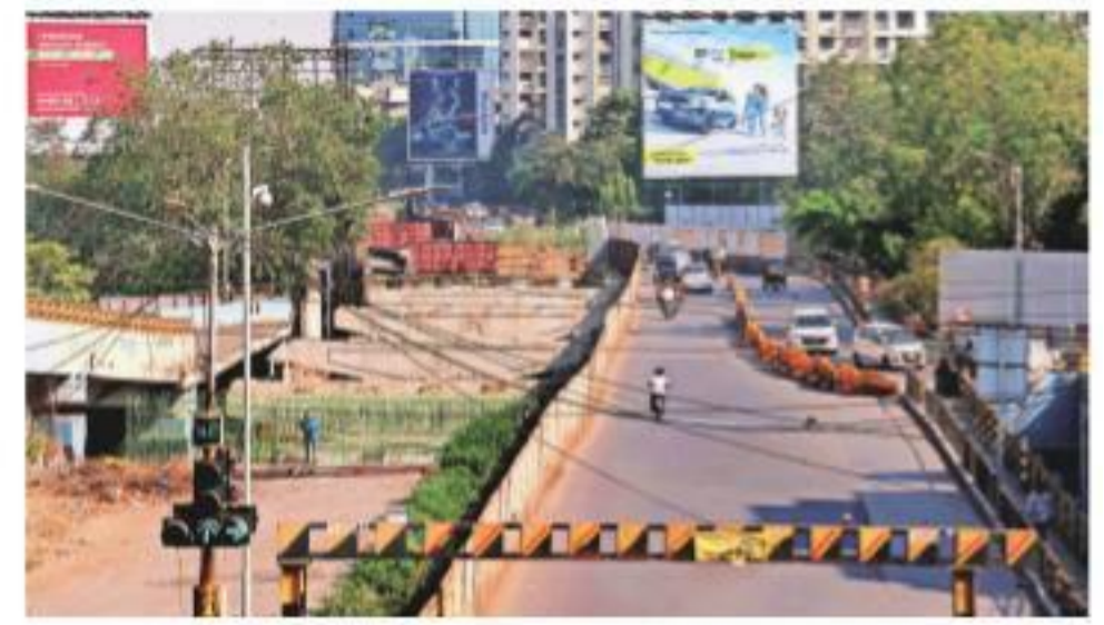
The bridge, an important link between Andheri East and West, will be closed for at least two years. Amit Chakravarty

The BMC decided to shut the bridge as it found the structure to be unsafe during a structural audit in September. The audit found