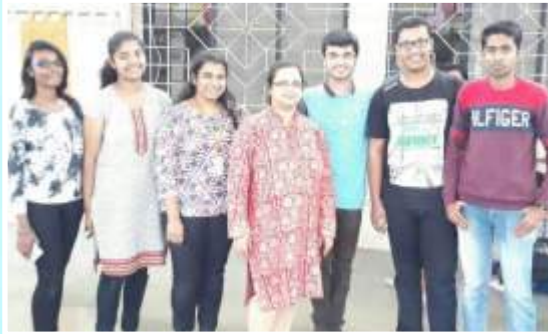
Social Cell Council

for the 'Feed the Poor' campaign which will be conducted by the ASC in March. Many student volunteers also turned up to help in collecting and weighing the 'Raddi'. This event went as planned and a total amount of Rs. 2,600 was raised.